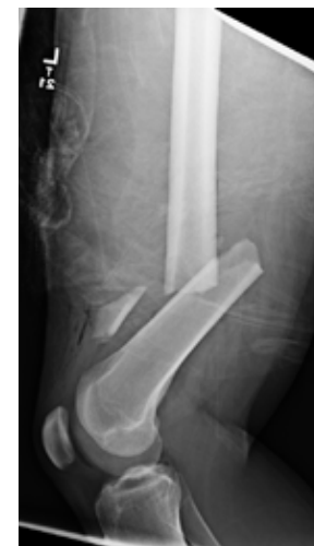
The X-ray shows an open femoral shaft fracture (comminuted and markedly displaced with apex posterior angulation). He underwent debridement and stabilization of the femur with an intramedullary rod on the day of injury.

“The challenges that these patients face when it comes to simply getting out and making a living can be quite daunting,” says METRC co-chair Andrew N. Pollak. “The latest data I’ve seen show that half of them are never able to get back to work, in any capacity. Numbers like that really demonstrate the urgency of the work the Consortium is doing.”