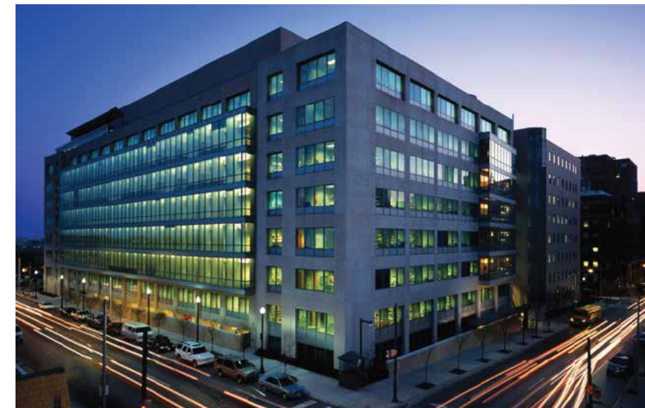
The Johns Hopkins Bloomberg School of Public Health

Teams are formed for each study and led by one of two Associate Directors for Trial Management. These teams tap into the expertise of each of the 5 cores as needed in varying phases of protocol development, study initiation, ongoing monitoring and reporting, data analysis and study closeout.